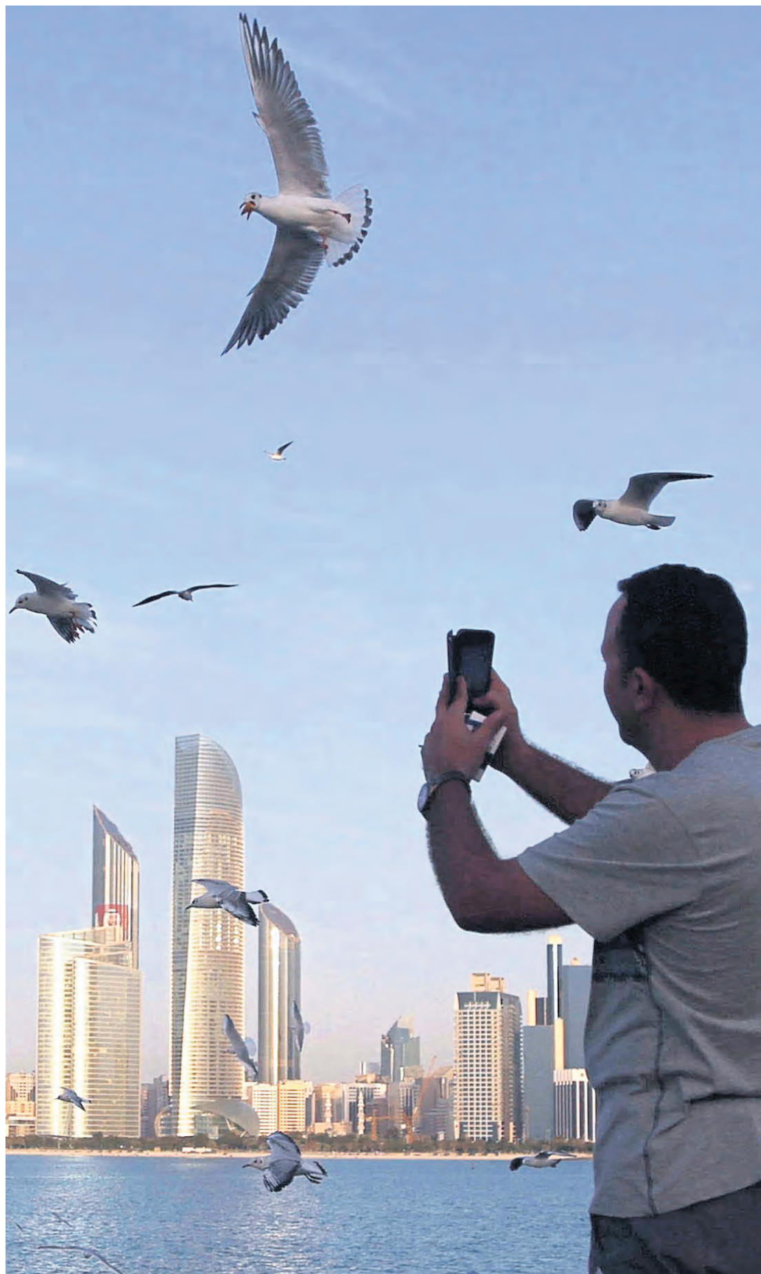
Flying high: the UAE is focused on attaining SDG targets

"So when we report back to global organisations, such as the UN, we provide robust, credible