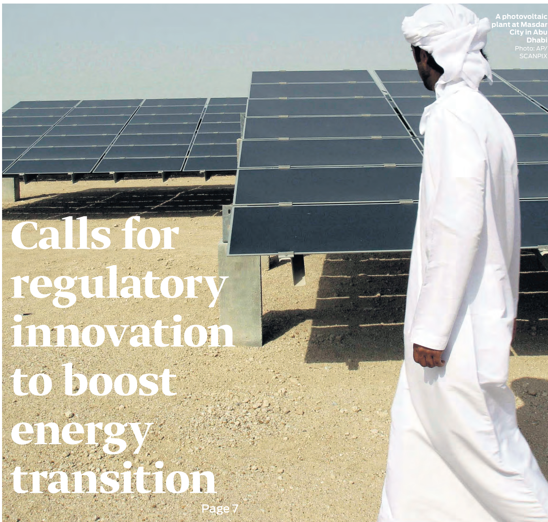
A photovoltaic plant at Masdar City in Abu Dhabi