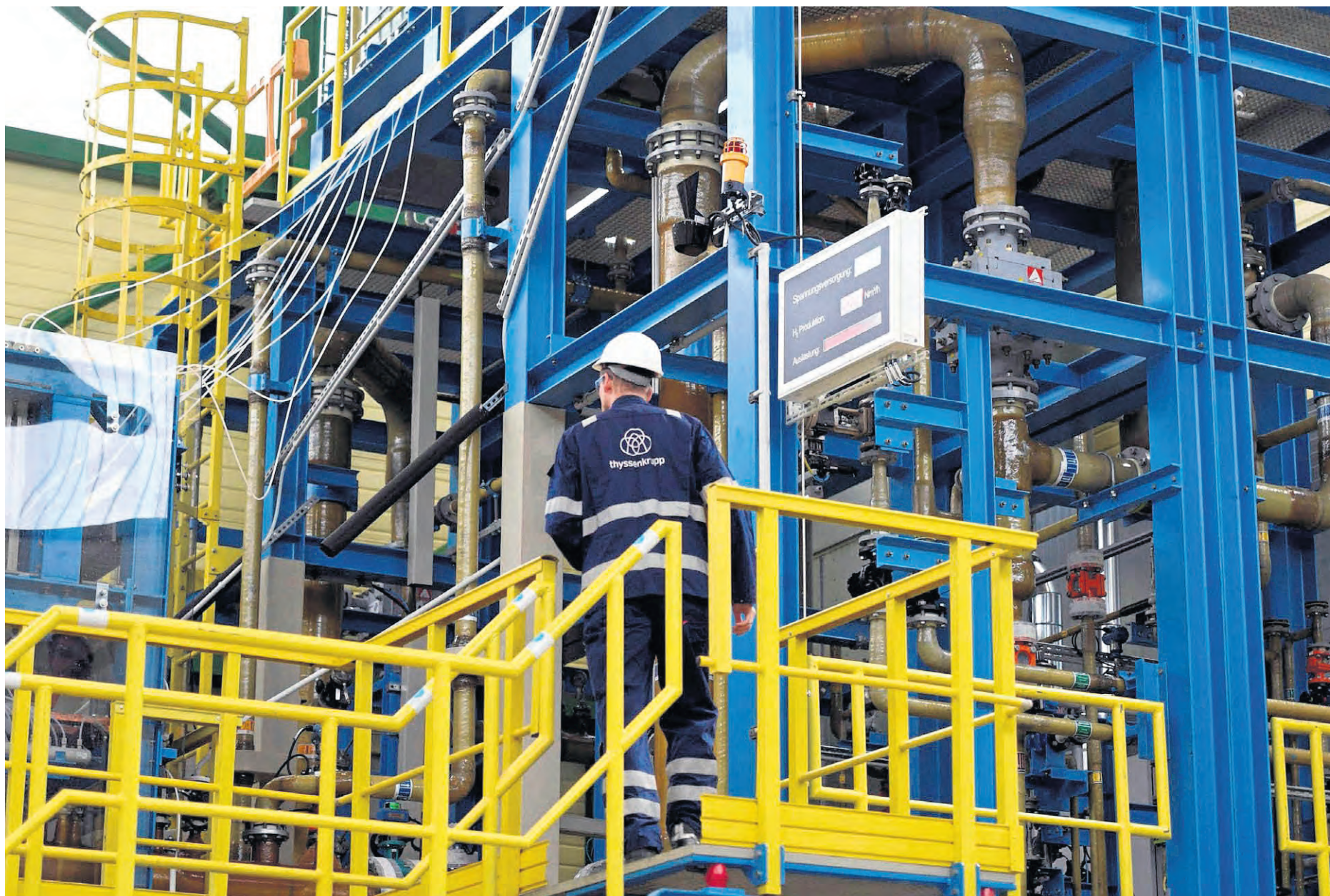
On site: a ThyssenKrupp worker at the Carbon2Chem project in Duisburg, Germany