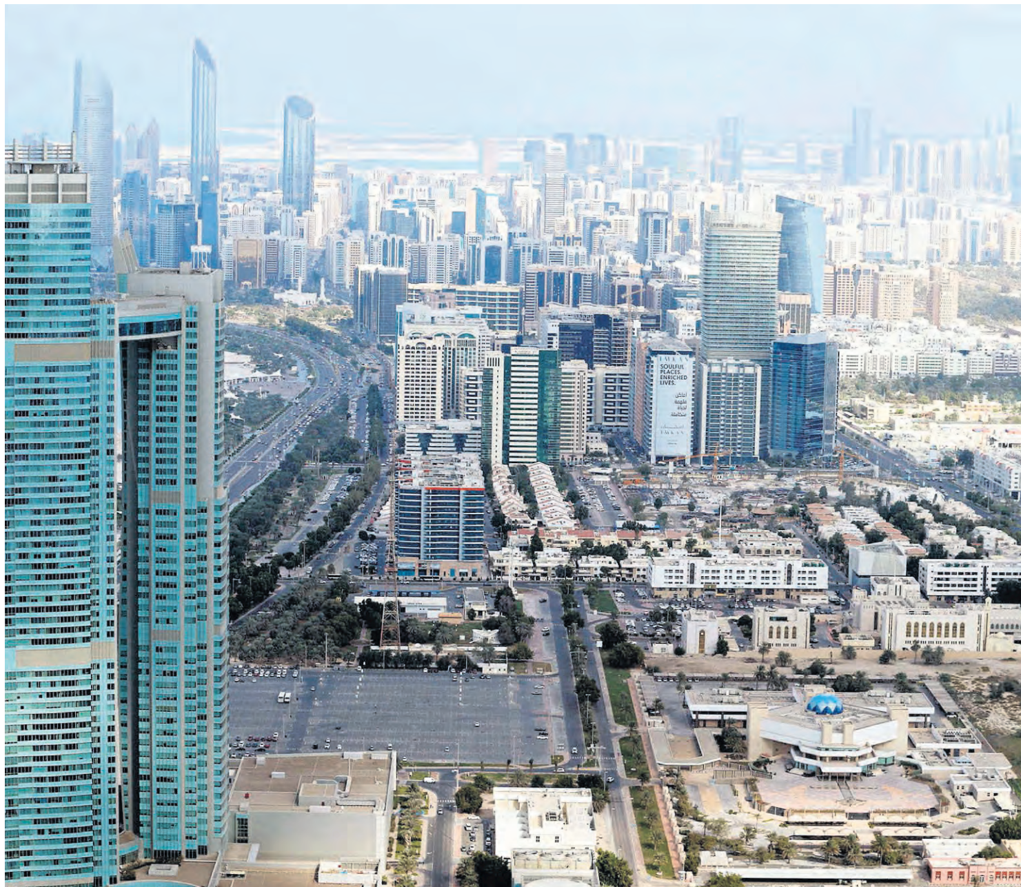
Overview: Abu Dhabi. The UAE is already taking innovative measures in the move towards decarbonisation