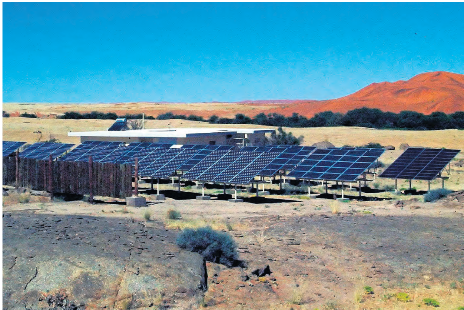
Powering up: a solar electricity hybrid system at Namibia's Gobabeb desert research station