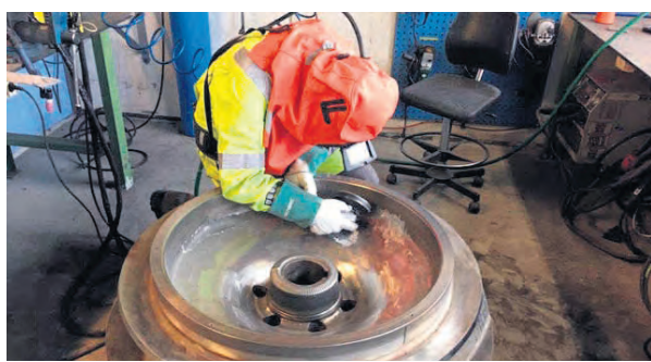
Left and top: Siemens reverse engineered a crucial part for a 100-year-old Ruston Hornsby vintage car using 3D printing and without any original technical drawings