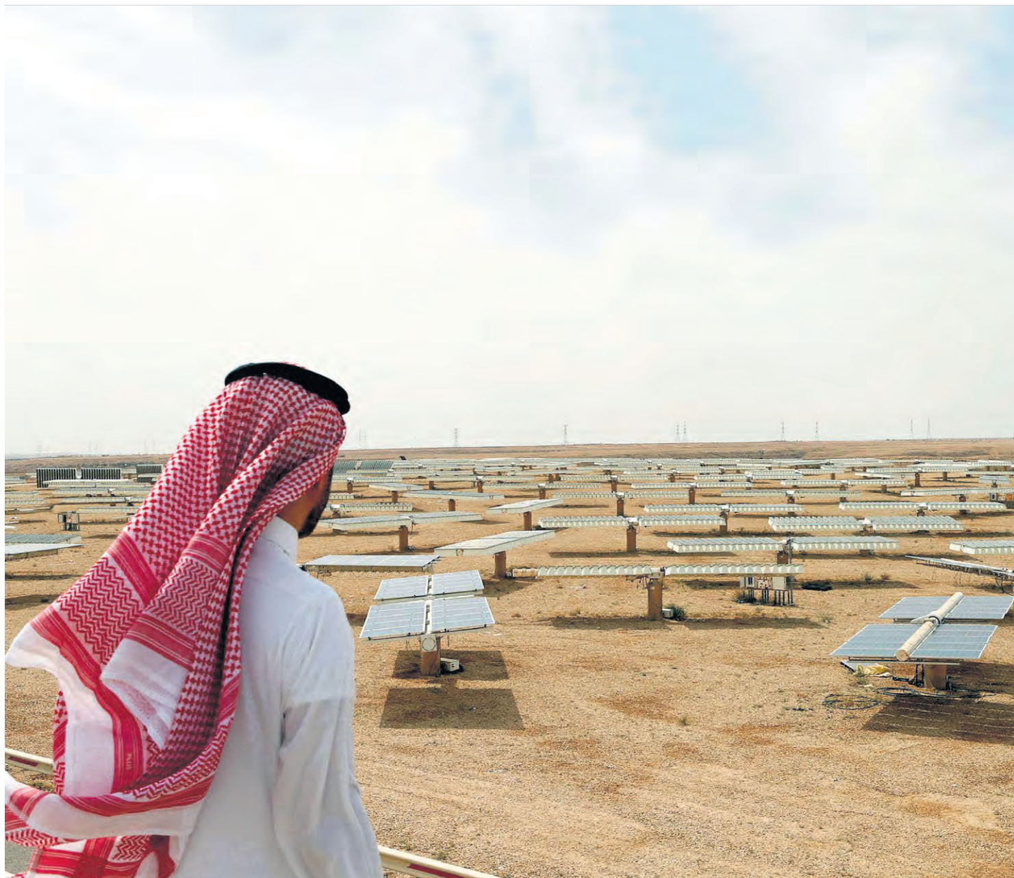
Powering up: a solar plant in Uyayna, north of Riyadh, Saudi Arabia